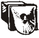
WATER CHUTE TWO SIZES

115mm face (30mm hole) 155mm face (50mm hole)