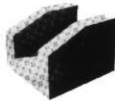
WATER SPOUT - Heavy Duty

110mm lip projection 230mm wide x 165mm high