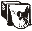
WATER CHUTE TWO SIZES

115mm face (30mm hole) 155mm face (50mm hole)