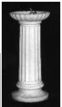
RICHMOND DRINKING FOUNTAIN 765mm high With spring loaded valve.

An isolating stop cock is recommended to facilitate maintenance. Delivery does not include installation. Advise us if the waste water will be plumbed away