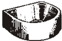
GULLY TOP 420 x 420 x 175mm

430 x 390mm Height 310mm Trough 220mm x 100/120mm