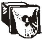
WATER CHUTE TWO SIZES

115mm face (30mm hole) 155mm face (50mm hole)