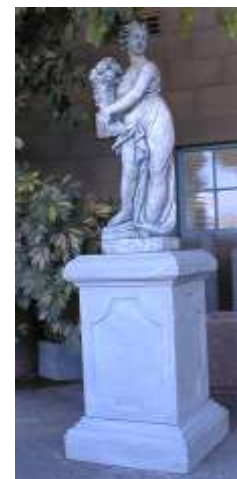
WARWICK 760mm high Base 500mm square.