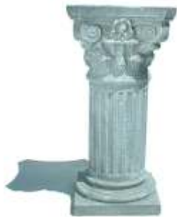
CORINTHIAN 88 760mm high Base 320mm square Cap 370mm square