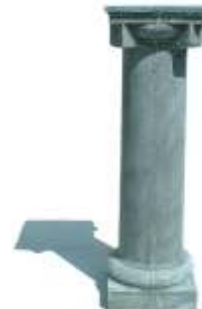
MARKET 680mm high