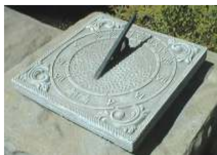
GREENWICH 245mm sq

How to set your Sundial Plate Mount the plate level. Turn the Sundial so that the toe of the Gnomon points directly North. The high point of the Gnomon will be to the South. The Sundial Plate is not intended for accurate time reading. As the seasons wax and wane, so will the accuracy.