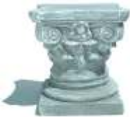
CORINTHIAN 88 410mm high