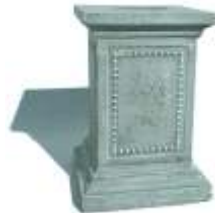
BEADED 510mm high