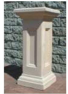
CLASSIC 690mm In grey/antique or cast stone. Base 280mm. Top 300mm