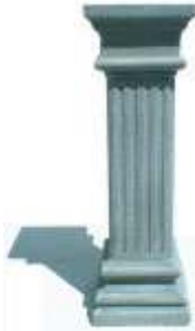
SQUARE REEDED 66 760mm high x 235mm