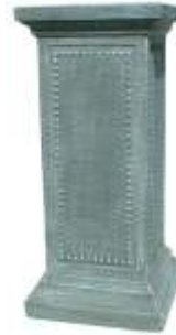
BEADED 770mm high 355mm base x 330mm top