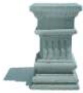
SQUARE REEDED 66 410mm high