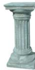
RICHMOND DORIC 760mm high 350mm base