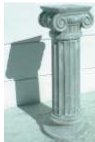
IONIC PEDESTAL 840mm high 230mm square cap