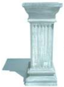
SQUARE REEDED 88 760mm high