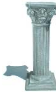
CORINTHIAN 66 760mm high Base 300mm square