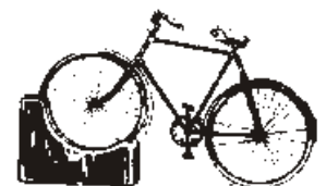
QUADRANT CYCLE RACK 660mm long x 380mm high at back x 125mm wide Drained to the side and with locking hole through rack.