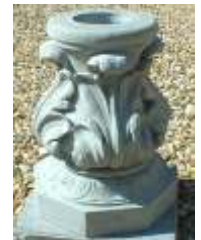
BARBANIA 555mm high