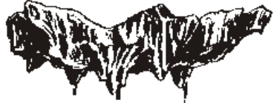
BARBERTON 762mm diam irregular shape 255mm bed 3 falls of water from main stalactites Also supplied as BARBERTON WEIR