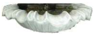
SEAWAVE WALL BOWL 1040mm wide x 280mm high x 700mm deep