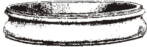
RIO RANGE OF BOWLS MAJESTIC 1,830m diam MAXI 1,280m diam MAJOR 1,030m diam MINOR 775mm diam MINI 530mm diam