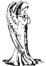
ANGEL 375mm high