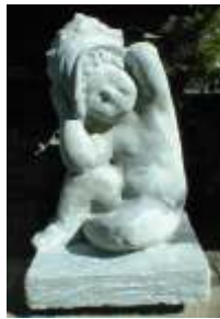
SHELL BABY 400mm high