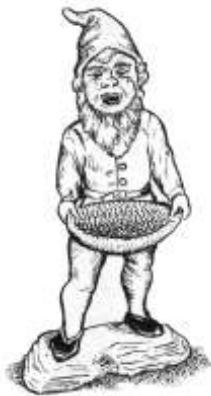
RUDOLPH 690mm high