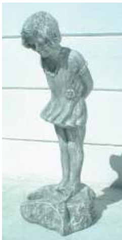
WENDY 890mm high