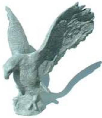
EAGLE 800mm high