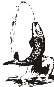
SURF RIDER 480mm high