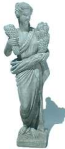
CERES 1.370m high