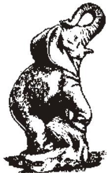
ELEPHANT 762mm high