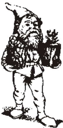
RUMPELSTILTSKIN 915mm high With open pots for planting