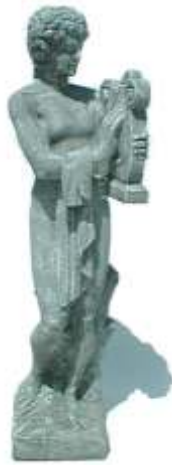
ORPHEUS 1,370m high