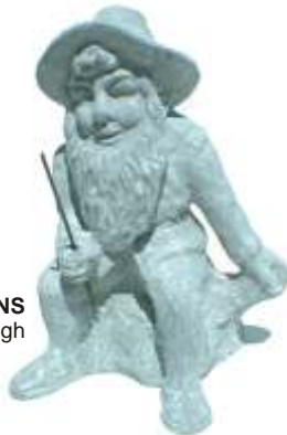
HANS 584mm high