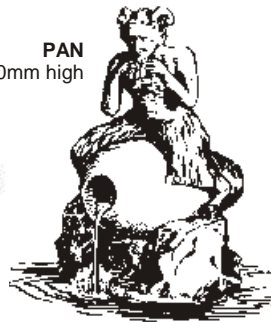
PAN 660mm high