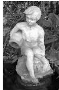
WATER POURER 510mm high