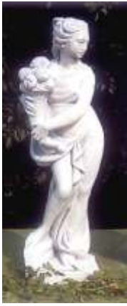
AUTUMN 900mm high