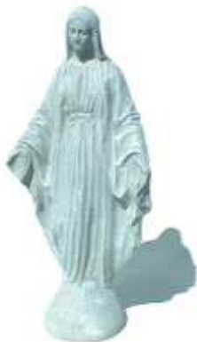
PEACE 840mm high