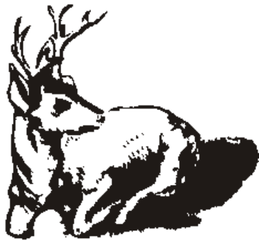
BUCK MAJOR 686mm long 610mm high