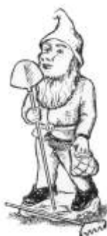
GARDENER 560mm high