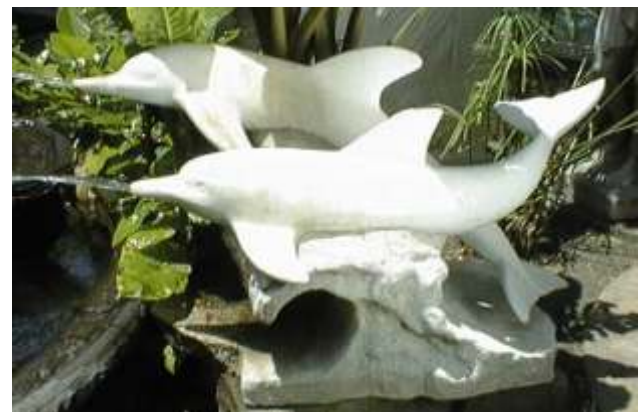
DOLPHINS 1m long x 550mm high