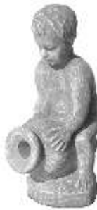
URN RIDER 510mm high