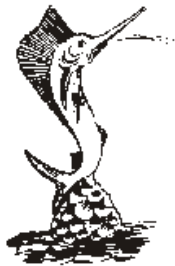
SAILFISH 790mm high