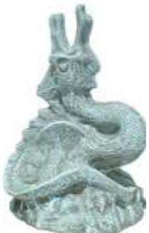
DRAGON 400mm high