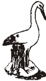
WATERFOWL 635mm high