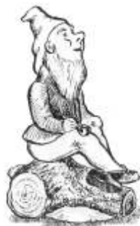
FRITZ 610mm high