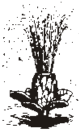
PROTEA JET 200mm high