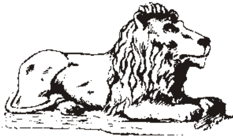
LION COUCHANT 915mm long