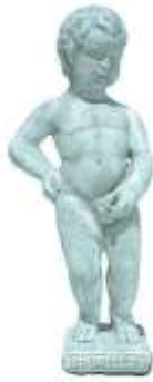
BRUSSELS BOY 600mm high