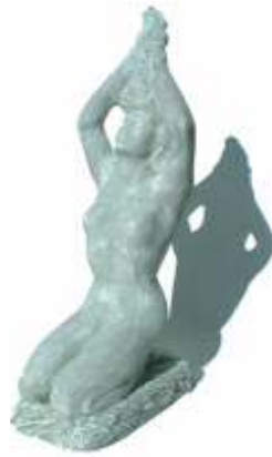
SPIRIT of SUMMER 965mm high