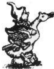
YACOB 330mm high