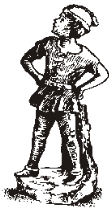
PETER PAN 815mm high