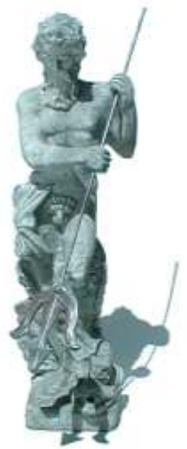
NEPTUNE 1,370m high