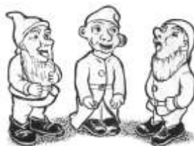
BRUNO DOLFIE OTTO Each 305mm high