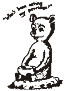
BABY BEAR 420mm high