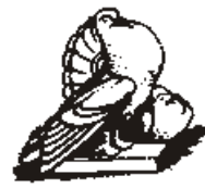
TWIN FANTAILS 280mm