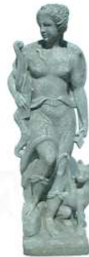
DIANA 1,370m high