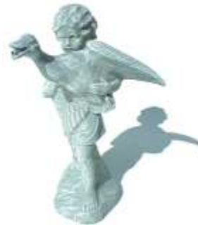
GOOSEGIRL 510mm high