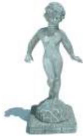
DANCING GIRL 585mm high Base extra.