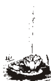
LILY JET 240mm across