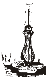
LOTUS JET 420mm high