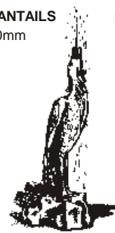
CRESTED CRANE 710mm high