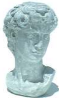
DAVID BUST 430mm high