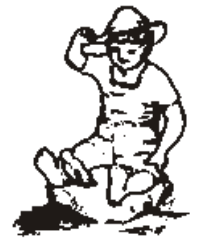
KARL 480mm high