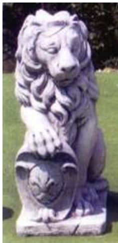
LEONE ZENO 550mm high