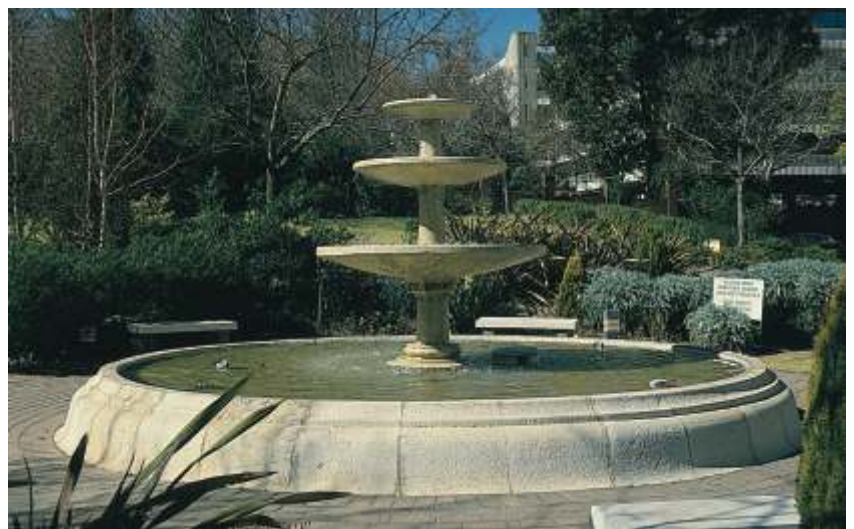
BLUE CIRCLE Fountain Pool 6m diam x 600mm high Overall 2,1m high