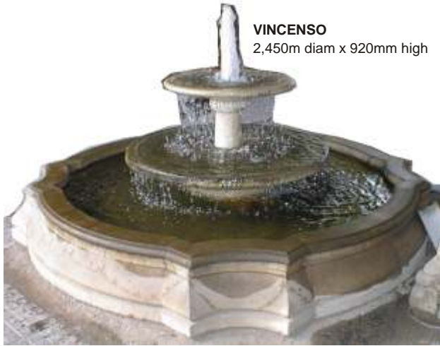
VINCENSO 2,450m diam x 920mm high