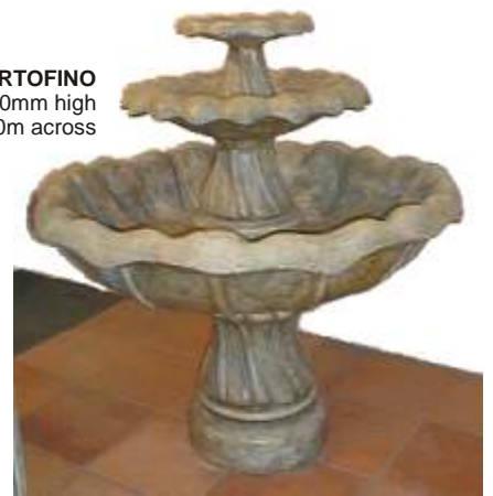
PORTOFINO 950mm high 1,100m across