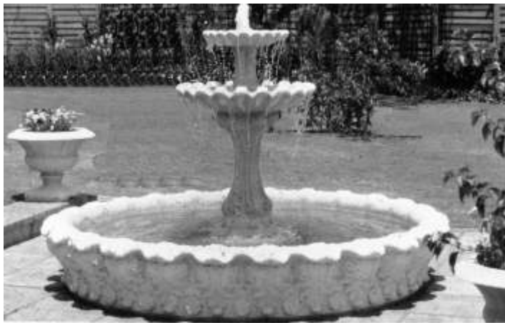
DA VINCI FOUNTAIN Pool 2,200m x 400mm