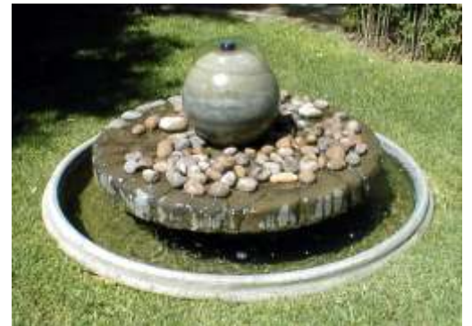
RIO PEBBLE FOUNTAIN 1,3m diam