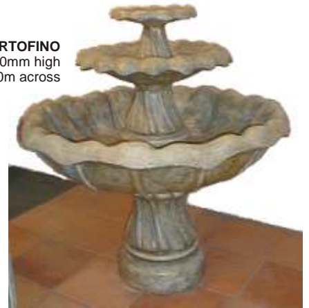
PORTOFINO 950mm high 1,100m across