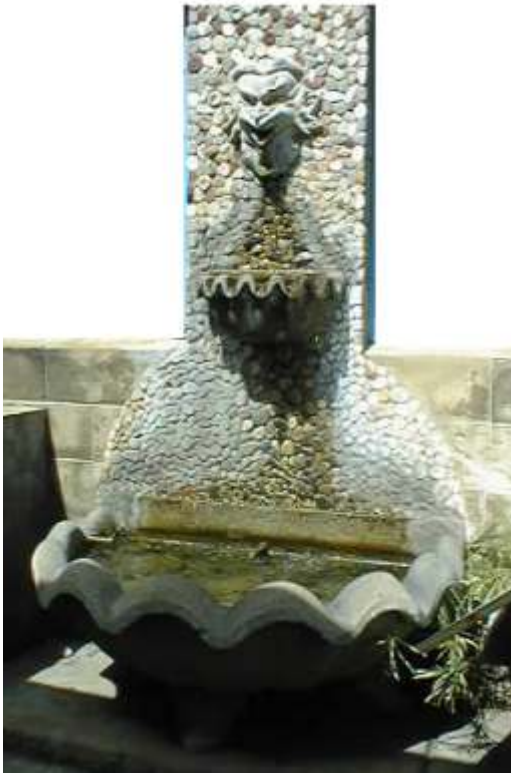
TUDOR PEBBLE 1,830m high x 1,520m across