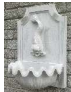
PLANTAGENET WALL MINI 700mm high x 500mm wide