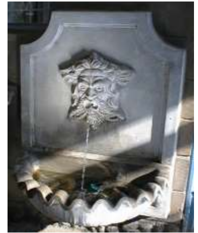
PLANTAGENET WALL UNIT 1,060m high x 860mm wide Various masks may be used