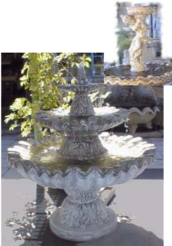
SOLVAY 1,200m wide x 1,440m high Or with figurine in place of top bowl.