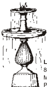
LIMA CASCADE 860mm high Main bowl 510mm Pump housing in base