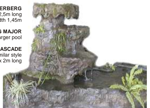
WINTERBERG CASCADE Similar style 1m high x 2m long