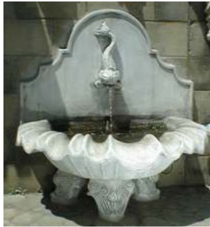
SEAWAVE WALL UNIT 880mm high x 1,030m wide Various masks may be used.