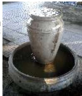
RIO ITALIAN OIL JAR