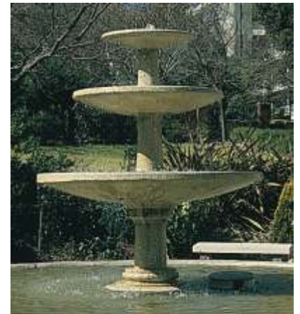
HOWICK CASCADE Height 2,100m Bowls 1,830m, 1,220m, and 762mm diam HOWICK CASCADE MINOR Height 1,800m Bowls 1,220m, 762mm, and 460mm diam