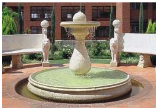
STRATFORD FOUNTAIN (Not including Seats) 1,830m diam 1,400m high