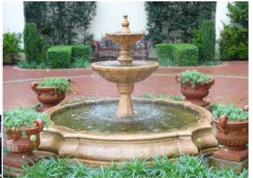
PROVÈNCE FOUNTAIN 2,450m diametre This fountain produces a fine splash.