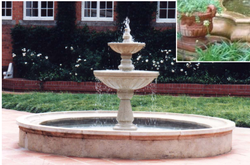
MICHAELHOUSE FOUNTAIN Pool 3m diam x 1,8m high. Bowls 520mm and 900mm diam.