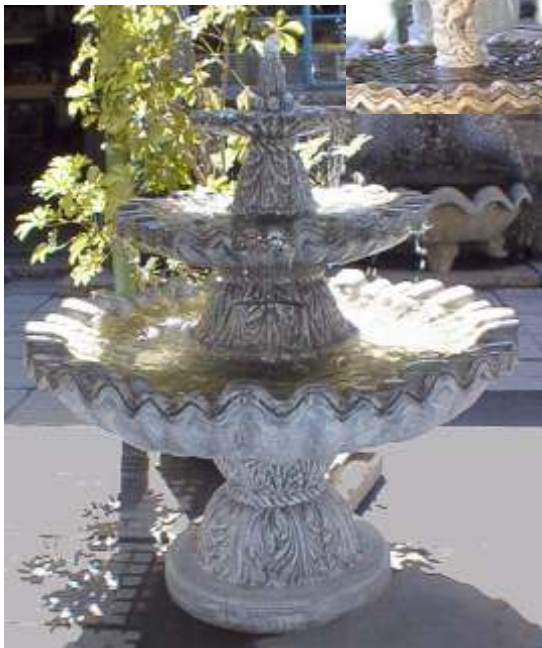
SOLVAY 1,200m wide x 1,440m high Or with figurine in place of top bowl.