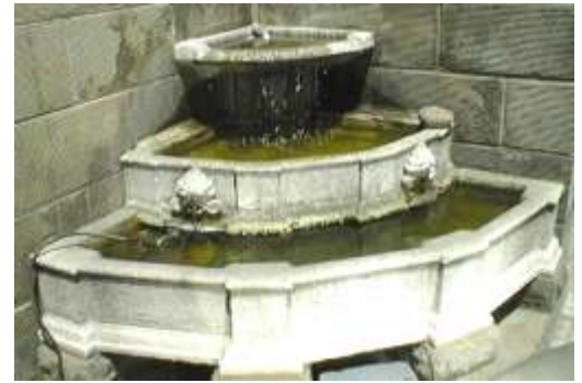
RAPALLO CORNER FOUNTAIN Pool 1m x 1m