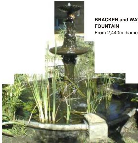
BRACKEN and WATERBABY FOUNTAIN From 2,440m diameter