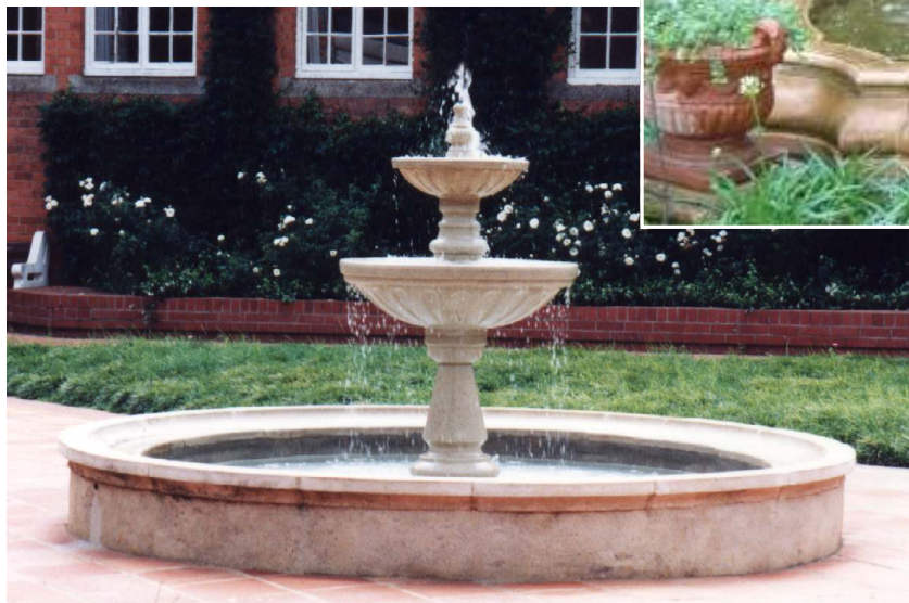
MICHAELHOUSE FOUNTAIN Pool 3m diam x 1,8m high. Bowls 520mm and 900mm diam.