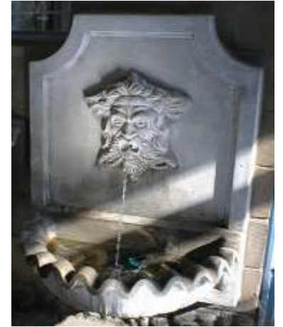
PLANTAGENET WALL UNIT 1,060m high x 860mm wide Various masks may be used