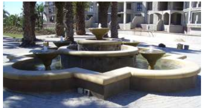
Example: Custom Made Fountain