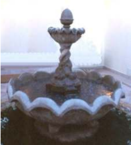
ROYAL TUDOR 1,830m high, 1,620m diam