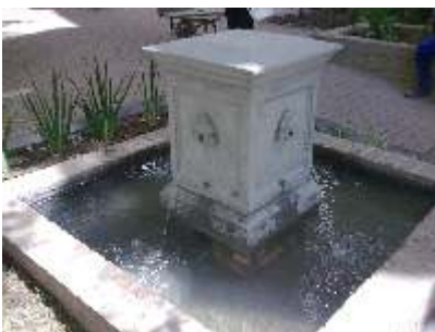
PLETTENBERG FOUNTAIN Pool approx 1,5m square.