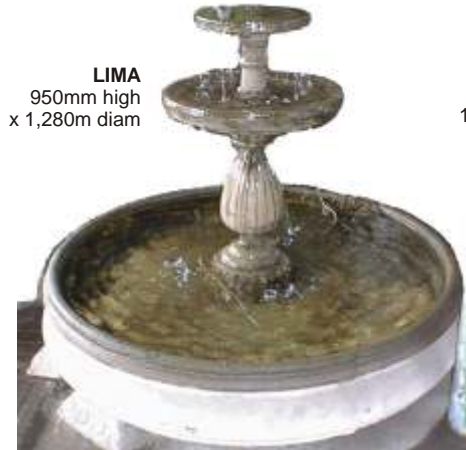
LIMA 950mm high x 1,280m diam