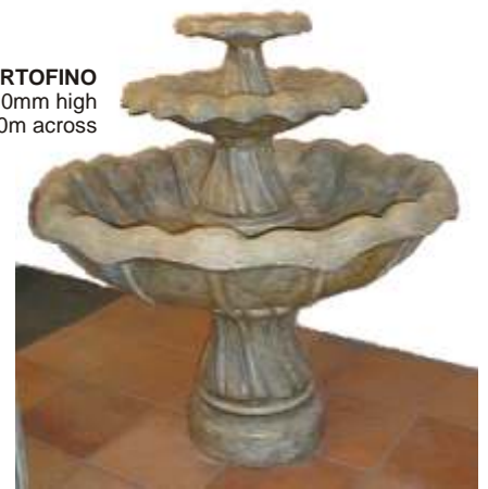
PORTOFINO 950mm high 1,100m across