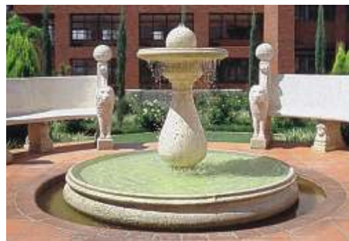
STRATFORD FOUNTAIN (Not including Seats) 1,830m diam 1,400m high