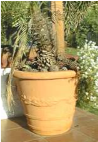
ROSEBANK 635mm across x 533mm high x 345mm across base