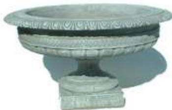
WESTMINSTER 815mm across x 430mm high x 305mm square base