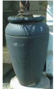
ITALIAN OIL JAR 460mm across x 735mm high