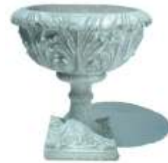
UMGENI 480mm across x 510mm high x 255mm square base