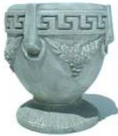
CERES 420mm across x 430mm high x 330 across base CERES JUNIOR 230mm across x 250mm high