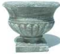
TROY 370mm across x 305mm high x 200mm square base