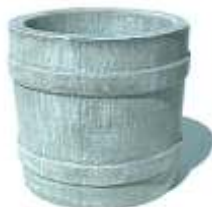
TUB 340mm across x 320mm high