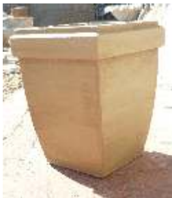
CHELSEA FRC SQUARE 400mm high and 610mm high