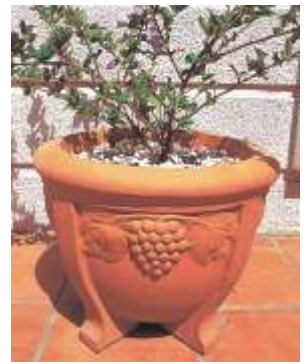
CORINTH 480mm across x 390mm high