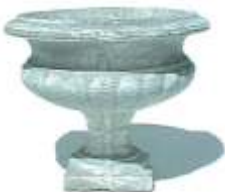
SAXON 460mm across x 380mm high