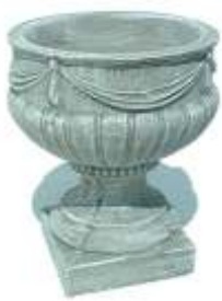
BEDFORD 355mm across x 432mm high