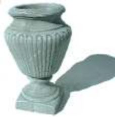
TROJAN 265mm across x 430mm high