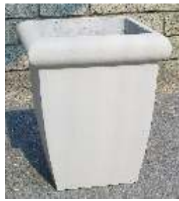
CHELSEA FRC BULLNOSED 410mm high x 340mm