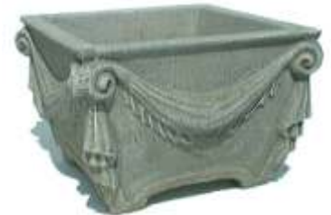
VAAL 495mm square x 330mm high