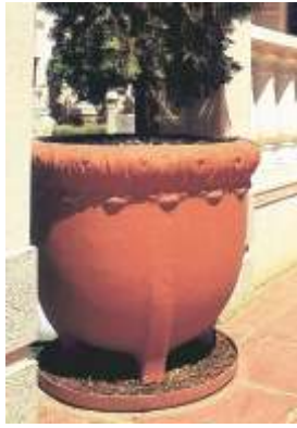
MUSTAPHA 660mm across x 620mm high