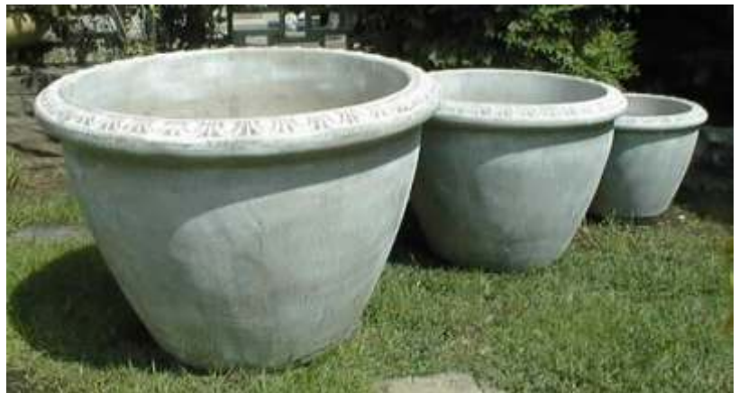
VILLAMOURA 1000 750mm high x 1,000mm diam VILLAMOURA 800 575mm high x 800mm diam VILLAMOURA 600 430mm high x 600mm diam VILLAMOURA 450 330mm high x 450mm diam