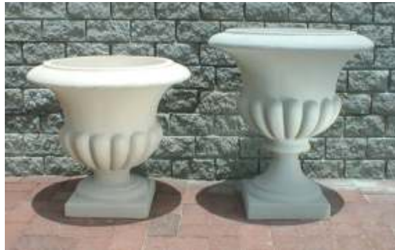
OLYMPIA 570mm high x 610mm OLYMPIA MAJOR 720mm high x 610mm