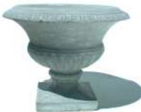
THRACE 635mm across x 495mm high x 290mm square base