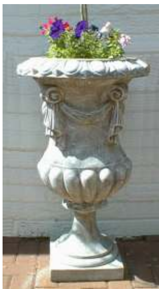
BALMORAL 900mm high x 520mm wide