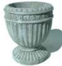
TULBACH 305mm across x 343mm high