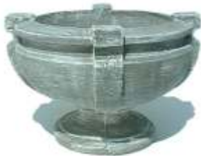
KENSINGTON 535mm across x 355mm high x 290mm across base