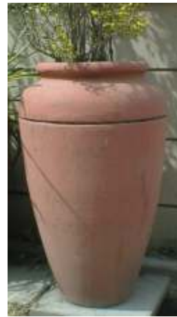
SPANISH OIL JAR 560mm across x 890mm high