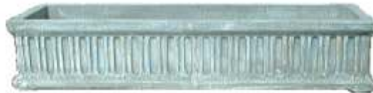
WELSH BOX MAJOR 1,220mm x 340mm x 240mm high