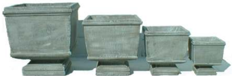
STONEHENGE MK6 610mm square MK5 500mm square MK4 400mm square MK3 300mm square