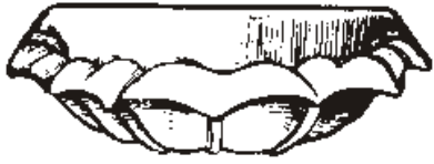
ALIWAL WALL 890mm across x 290mm high ALIWAL WALL MAJOR 1,050mm across x 290mm high