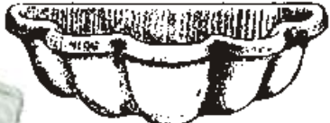
WINDSOR WALL 915mm across x 280mm high