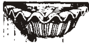
PLANTAGENET WALL 508mm across x 200mm high PLANTAGENET WALL MAJOR 710mm across x 200mm high