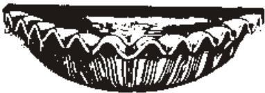
PLANTAGENET WALL MAXI 850mm across x 270mm high