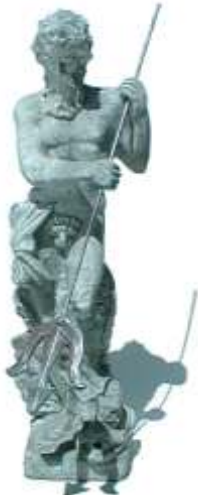
NEPTUNE 1,370m high