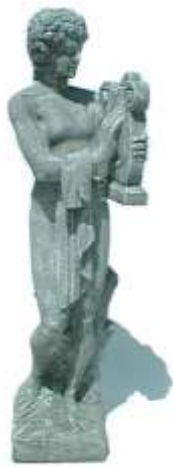
ORPHEUS 1,370m high