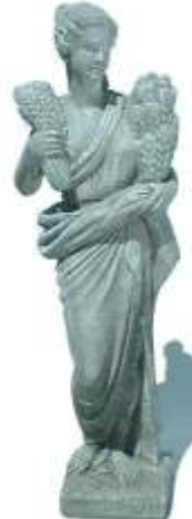
CERES 1,370m high