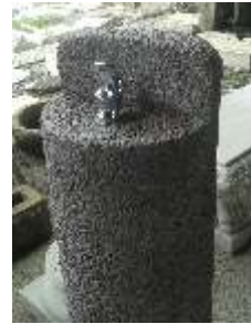
CIVIC DRINKING FOUNTAIN MK2