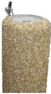
CIVIC DRINKING FOUNTAIN 1200/850mm high

RICHMOND DRINKING FOUNTAIN 765mm high With spring loaded valve.