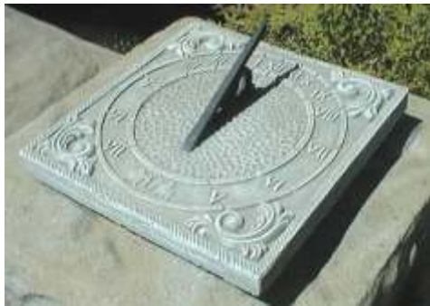
GREENWICH 245mm square