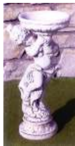
SORRENTO 600mm high