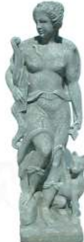
DIANA 1,370m high