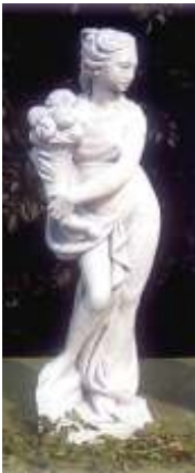
AUTUMN 900mm high