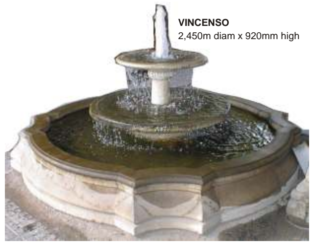
VINCENSO 2,450m diam x 920mm high

We no longer install fountains. These fountains are supply only. Purchasers of Supply Only fountains are assumed to have at least basic building skills. Fountains will be dry assembled at our factory prior to supply for inspection. Our staff will be available to explain the construction sequence (at our yard only). Tools for cutting and drilling will be necessary (tools not supplied). A suitable imersion pump will also be required (see pump specification required for your fountain).