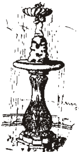
BRACKEN and WATERBABY 1,800m high