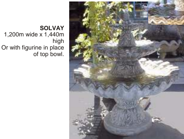
SOLVAY 1,200m wide x 1,440m high Or with figurine in place of top bowl.