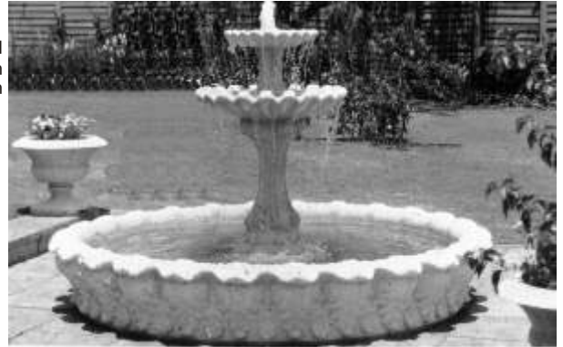
DA VINCI FOUNTAIN Pool 2,200m x 400mm Total height 1,400m