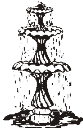
MEADOWBANKS CASCADE 1,550m high Bowls diam 840mm, 610mm and 320mm