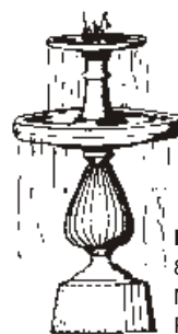
LIMA CASCADE 860mm high Main bowl 510mm Pump housing in base