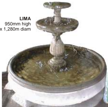
LIMA 950mm high x 1,280m diam